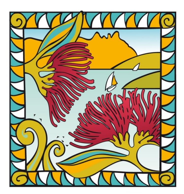
Parua Bay School